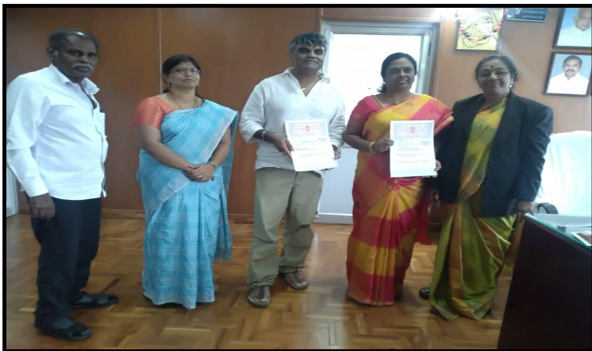
Department and Centre for Women's studies and KAMLA foundation UK signed MoU on 05.12.2019.